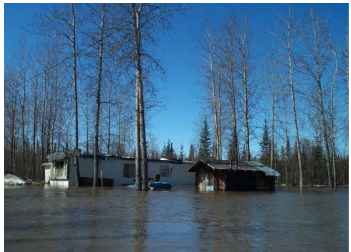
Photo 1: This photo was taken when the water was rising as an ice jam was moving down to Halfway Island. May 27, 2001.